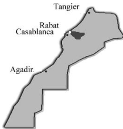
Fig. 1 Location of Rabat Province ( dark shading ), Morocco

Morocco is a country located in the north west of Africa with a population greater than 31 million (99.2% are Arab/Berber, considered as being of Caucasian ethnicity). Rabat Province (called Rabat-Salé-Zemmour-Zair) is located at a latitude of 34°N 6°W and an altitude of 75 m. Rabat city is the capital of Morocco (Fig. 1). The area of Rabat Province is approximately 9,580 km 2 (1.4% of Morocco's surface area). There are four distinct seasons: a mild spring and autumn, a hot summer (25°–36°C) and a cold winter (4°–20°C). There are typically approximately 18 h of daylight in summer and 10 h in winter. The mean rainfall is 46.3 mm/year. The economy of Rabat Province is based on Agriculture.